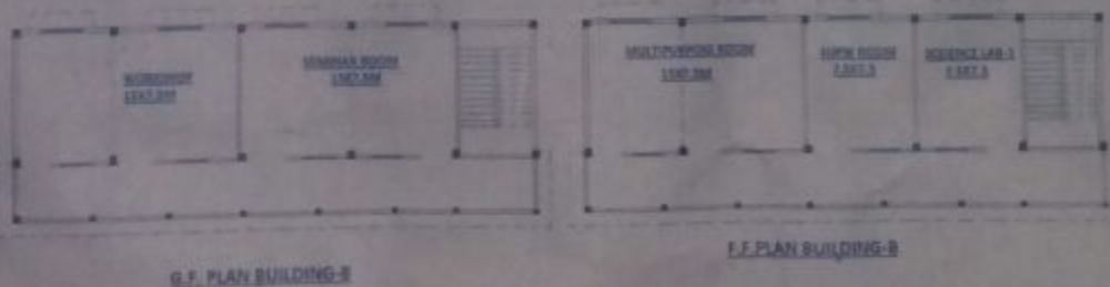
F.F. PLAN BUILDING-B

DRAWING OF EXISTING & PROP. THREE STORIED BUILDING OF MAHATMA RURAL DEVELOPMENT SOCIETY ( D.EL. ED.& B .ED. COURSE) TEACHER'S TRAINING INSTITUTE AT PLOT NO.-14 ST./RD.- BANSHIBATY VILL.- BANSHIBATY P.O.- GOPMAHALTAHSIL/TALUK.-DASPUR TOWN.- GHATAL DIST.- PASCHIM MEDINIPUR WEST BENGAL PIN- 721212MOUZA.- KALAGECHHIA J.L.NO.-204 KH.NO.-221 G.P.- KHANJAPUR